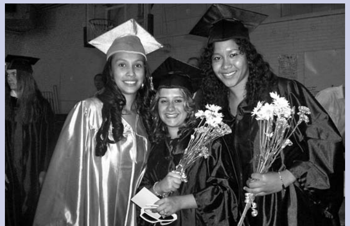
Flowing Wells HS graduates celebrate their accomplishment.